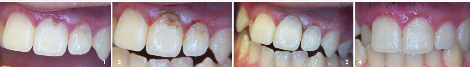
Case Study: Caries Access (1) Pre-op - Subgingival decay maxillary left central and lateral. (2) Collar tissue sculpted to expose decay using the fine tipped Scalpel Point electrode. (3) Decay removed, and teeth prepped. No additional retraction cords or pastes were used to maintain the dry field. (4) 1 week post -op.